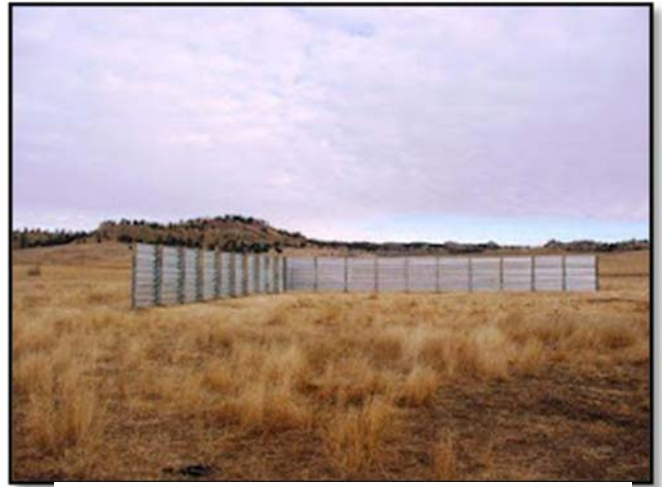
EQIP Fabricated Windbreak In Wyoming

Please stop into the Beulah Field Office by November 16, 2012 to sign an application! You can also contact the office at 701-873-2101 Ext3 if you have any questions.